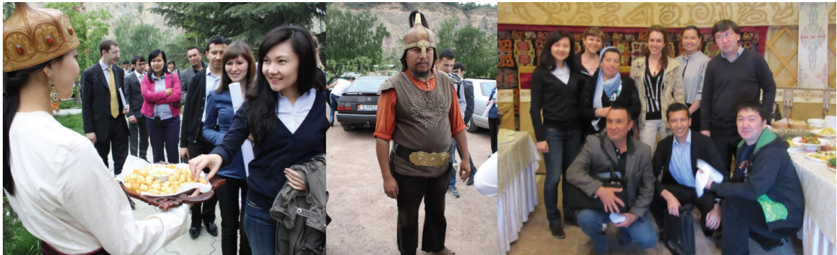
Alumni were met with traditional Kyrgyz hospitality

In order not to miss the opportunity to participate in the next alumni meeting, please, fill out the Alumni Survey 2013 in January!