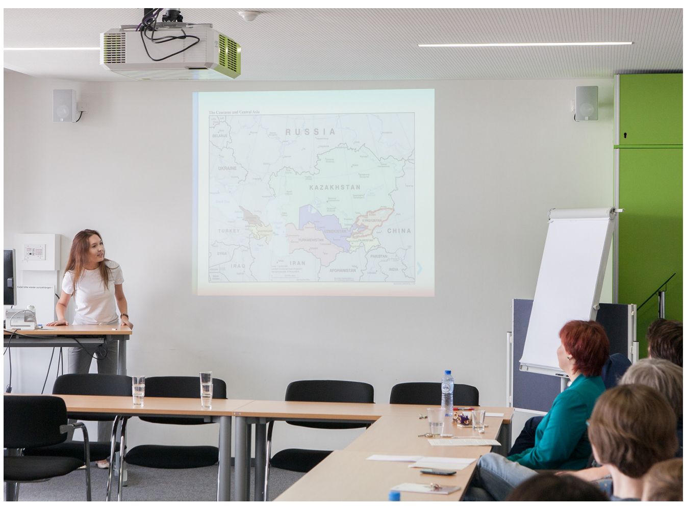
Meet the Start-ups seminar.

thereof, and learnt from peers with talented hearts and minds in the small, cosy city of Bielefeld, Germany.